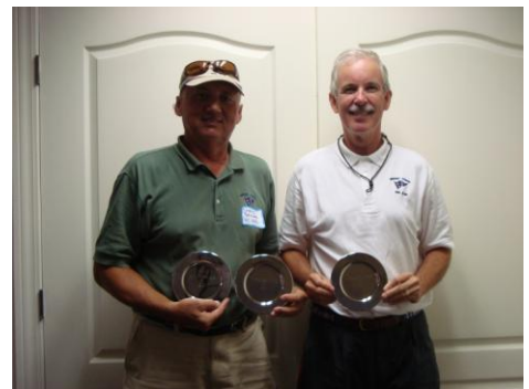
Bayview Mackinac Race 2010