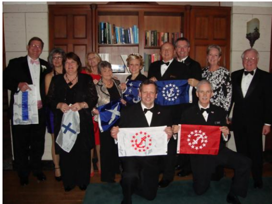
2011 GPSC Flag Officers and Board

We had a ball! January 15 th was 'B' day and there was great food, drink and dancing. My goal was fun - while not forgetting the official tasks of ringing in the new bridge, board and flag officers. We were a good looking group and I was proud to lead us in to the New Year for the Grosse Pointe Sail Club.